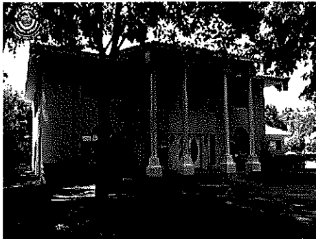
9102 SOUTH BAY DR, ORLANDO, FL 32819 9/4/2015 11:30 AM