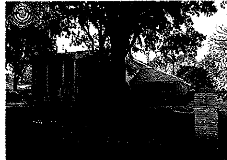
9102 SOUTH BAY DR 03/28/2014