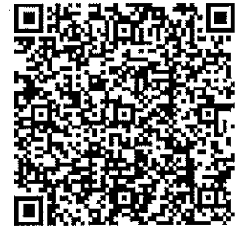
QR Code For Mobile Phone

Mailing Address 1714 Conway Isle Cir Belle Isle, FL 32809-3500 Physical Address 9102 South Bay Dr Orlando, FL 32819