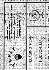
Exhibit "A" Page 2