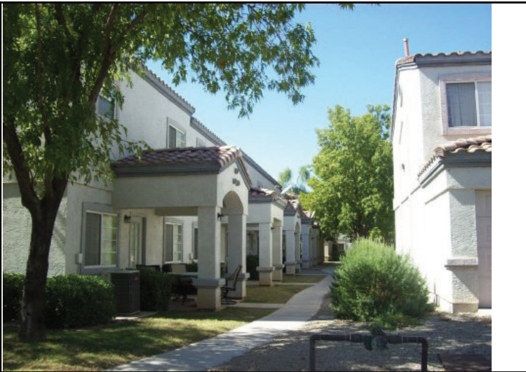
REAR OF SUBJECT PROPERTY